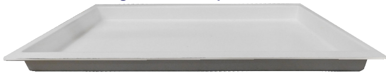
Acid Storage Containment Tray to contain large spills and provides ease of cleanup. (located in bottom of cabinet)

For storage of ACID and corrosive chemicals, available in 12", 18", 24", 30", 36", 42" & 48" widths. Standard 35 1/4" high and 22" deep cabinet dimension. (as shown) U.L. 1805 Fume Hoods & Cabinets. Cabinets are designed to hold specific chemicals